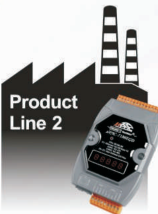
Product Line 2