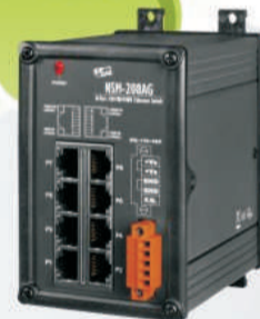
Switch or PoE Switch