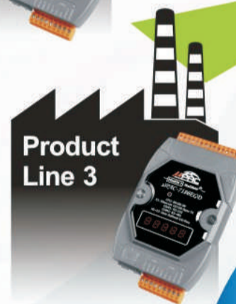
Product Line 3