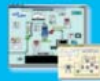
SCADA software Soft PLC OPC,OCX