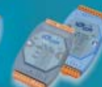
I-7000 Series Remote I/O Modules