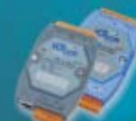
I-7188 Series Palm-size Embedded Controller