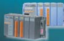
I-8000 Series Compact Embedded Controller